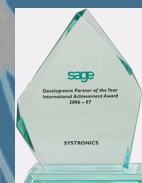
Sage Accpac™ – Development Partner of the Year International Achievement Award (Dubai, 2007)

SYSTRONICS' achievements over the years have been recognized by some of the world's leading technology providers: