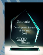
Sage Accpac™ – Development Partner of the Year (Vancouver, 2005)