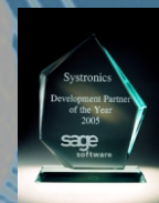
Sage Accpac™ – Development Partner of the Year (Vancouver, 2005)