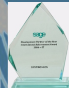
Sage Accpac™ – Development Partner of the Year International Achievement Award (Dubai, 2007)

SYSTRONICS' achievements over the years have been recognized by some of the world's leading technology providers: